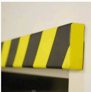
Flat "Rectangular" Profile