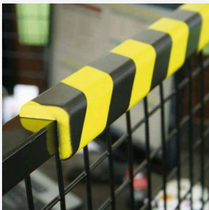
Square Corner "L" Profile