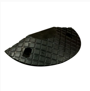
Black End Cap - Rubber Speed Hump (70mm)