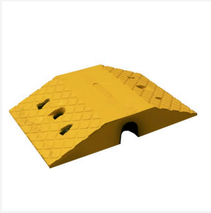
Yellow Body - Rubber Speed Hump (70mm)