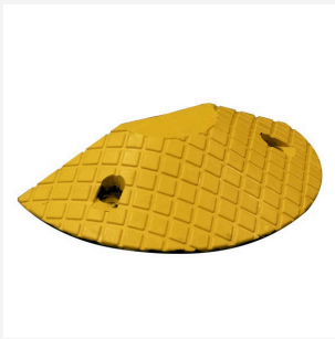
Yellow End Cap - Rubber Speed Hump (70mm)