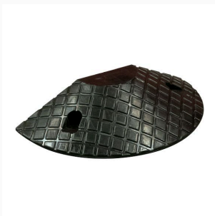
Black End Cap - Rubber Speed Hump