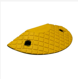
Yellow End Cap - Rubber Speed Hump