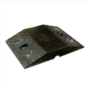
Black Body - Rubber Speed Hump