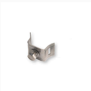
29mm Stainless Steel Banding Bracket