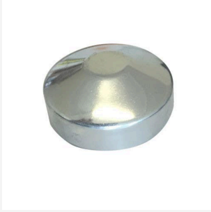
60 ODI Galvanized Post Cap