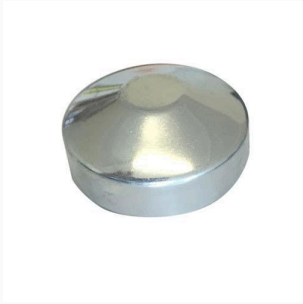
76 ODI Galvanized Post Cap