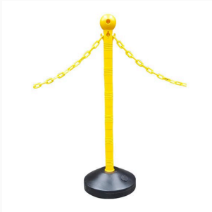
Yellow Guideline Post (with water filled base)