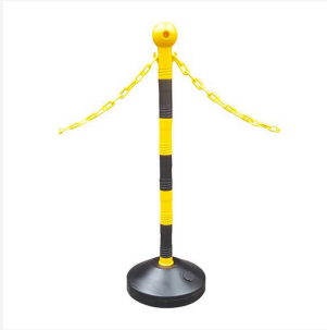
Yellow/Black Guideline Post (with water filled base)